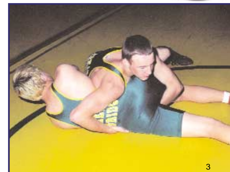
3-The opponent sensing the top man is going for a churella hook has shifted his left hip down into the man.