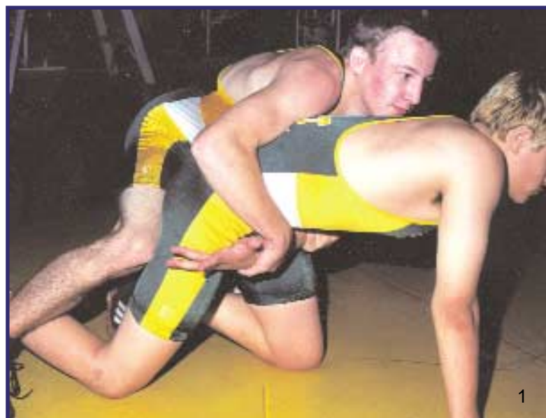
1-The top man is beginning to brake the bottom man down and has secured the opponent's left wrist with his right hand.