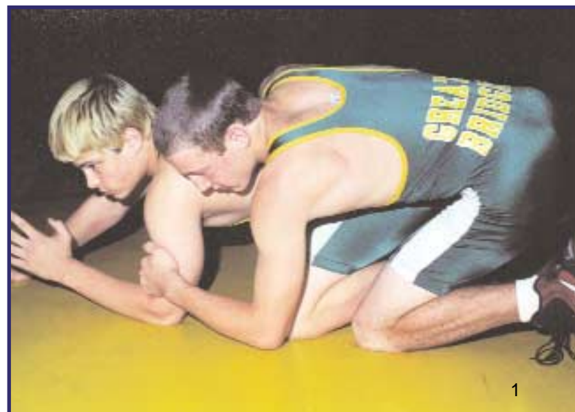
1-The top man has chopped his opponent to his left elbow while he is bumping his opponent in his rearend with big right knee.