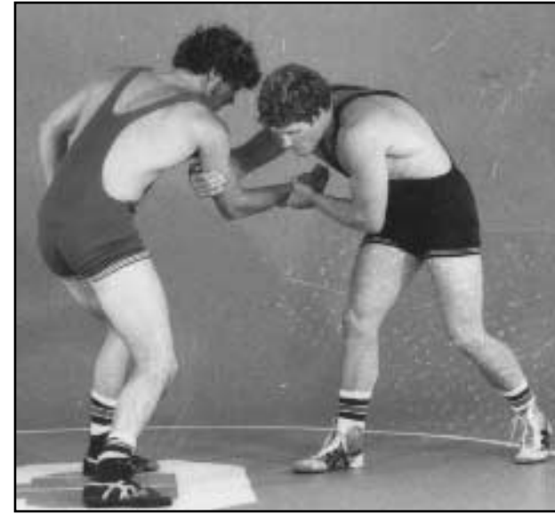
C - Tug hard on the drag as you jab step with your left leg.