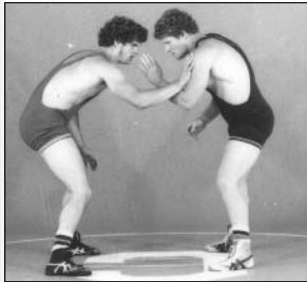
A - As your opponent reaches for you, block his arm below the elbow and with a spiral action ring out his arm, passing it across in front of you.