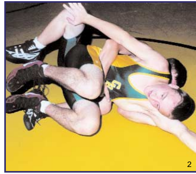
2-The offensive man is beginning to run the circle by pushing out of the opponent's lap with his right hand and lifting his left hand above his head. This is important because you do not want the opponent to be able to control a two-on-one on you.