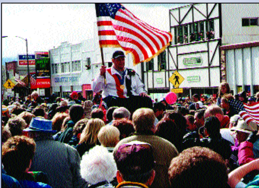
Rulon celebrating with his hometown crowd in Afton, Wyoming after his victory in the Olympics.